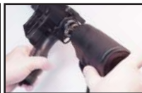
Remove HPA Tank/CO2 Cartridges