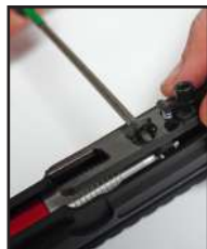
Advanced Feed Tube [Gen 2 Only]

Gently pull straight up on the gripline to pull the contact yoke out of place. Then, use a hard tool like an allen wrench to pull the contact yoke connector pin out of the engine.