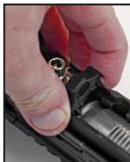
Engine Retaining Clip [Gen 1 or 3]

Gen 1 and Gen 3 MTWs have an engine retaining clip that can be removed by hand. If your MTW has a poly feed tube or the Advanced Feed Tube Assembly [Gen 2] use a hard tool like an allen wrench to carefully lever the feed tube assembly out of the upper receiver.