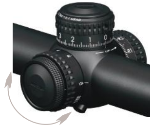
Rotate Side Focus Dial

Parallax is a phenomenon that results when the target image does not quite fall on the same optical plane as the reticle within the scope. This can cause an apparent movement of the reticle in relation to the target if the shooter's eye is off-centered. Correctly focusing the target image will allow it to fall on the same optical plane as the reticle within the rifle scope.