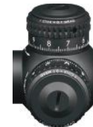
MRAD Models "1 Click = 0.1 MRAD"