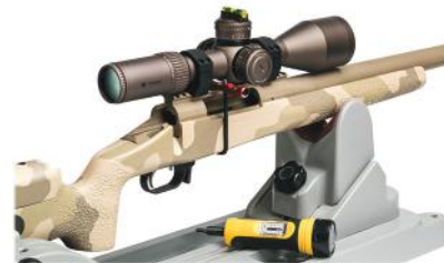
Using bubble levels to square the riflescope to the base.