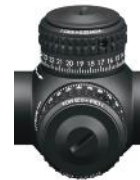
MOA Models "1 Click = 0.25 MOA"

Depending on which version you have purchased, your Razor HD AMG riflescope will feature adjustments and reticles scaled in MOAs or MRADs. Both minute-of-angle (MOA) and milliradian (MRAD) unit of arc scales are equally effective when ranging or adjusting riflescope for bullet trajectory.