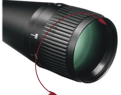
Adjustable Objective (AO models)

Some of the Crossfire II riflescope models use an image focus/parallax adjustment which provides maximum image sharpness and eliminates parallax error. Lower power models do not use image focus/parallax adjustments and are prefocused at a distance of 100 yards.