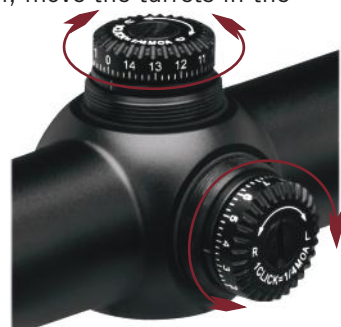
To adjust settings, turn dials:

After sight-in, you can realign the zero marks on the turret dials with the reference dots if you wish (see Indexing Adjustment Dials with Zero