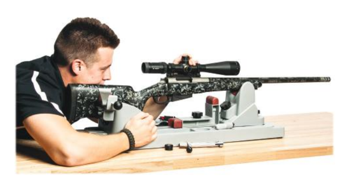
Visually bore-sighting a rifle.