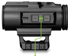
Power / Illumination Buttons

Press and hold the up (+) or down (-) button for three seconds to turn illumination off.