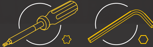
T-20 Torx screwdriver 5/64" Hex Wrench