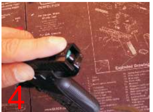
Move backpiece downwards