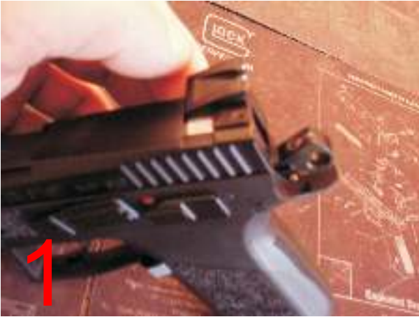
Gently remove rearsight