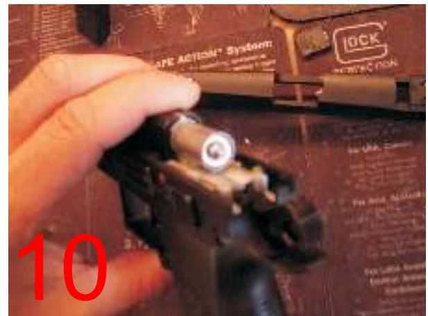
Valve-assembly seen from the back