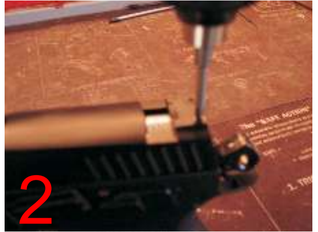
Remove screws from slide