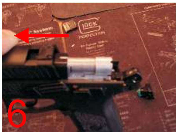
Pull slide off in the shown direction