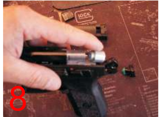
Gently unscrew the end of valve-assembly