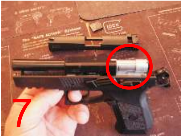
Slide removed and valve-assembly appears