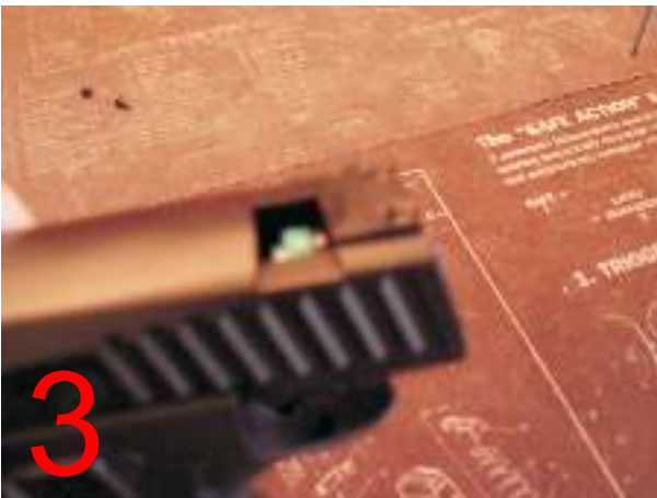
Move slide backwards